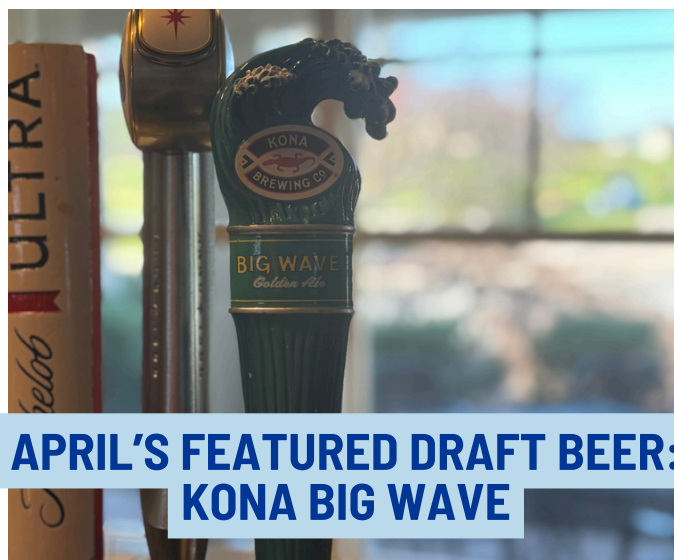
APRIL'S FEATURED DRAFT BEER: KONA BIG WAVE

Be sure to stop by and treat yourself to these delicious new additions—your taste buds will thank you!